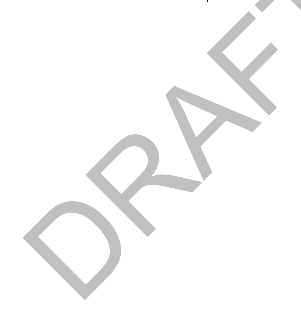
Table 4 - Citizen Participation Outreach