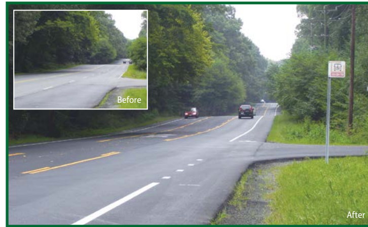
Lawyers Road, before and after a 2009 Road Diet

Reston, Virginia, a suburb of Washington, DC, is a planned community with a larger emphasis on non-motorized travel than many suburbs. The need for multi-modal accessibility has increased with the opening of a nearby rail transit station.