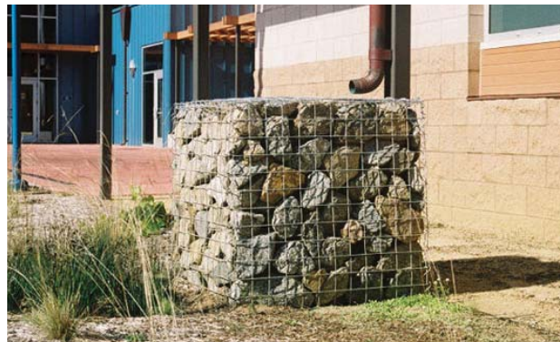
Gabion for Energy Dispersion (i.e. erosion control)

If a planted LID drainage feature receives a concentrated flow, energy dispersion devices will be required at the entry point to deter damage or erosion to the planted areas. Examples of erosion protection/energy dissipation designs include cobblestones, gabions, small hardscaped areas, or other approved devices.