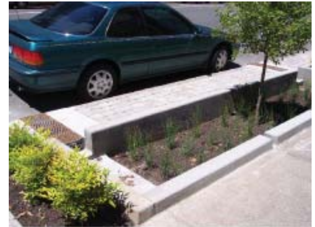
Bioretention basin along an urban roadway.

Care requirements should be considered when choosing plant species for LID drainage features. Trash and debris should be cleaned out of LID planting areas periodically, especially after large storm events. Drain inlets shall be cleaned out periodically.